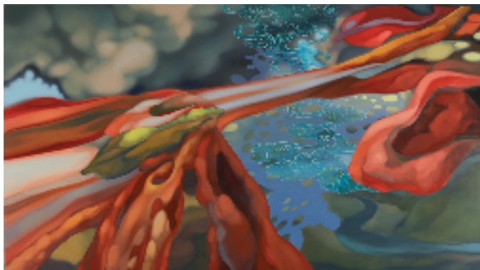
The Persistent Nature of Past, Present, and Future (2008) oil and acrylic on Dibond aluminum, 48" x 84"

May 8 - 10, 2009 Friday 4 - 7 PM, Saturday & Sunday, 12 - 5 PM